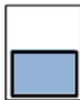
1/2 Horizontal 7.625" x 4.8750" $500.00