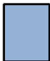
Back Cover 8.5" x 11" $1,200.00

Please choose from the following size options: