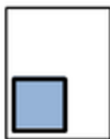
1/3 Horizontal 5" x 4.8750" $400.00