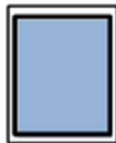
Full Page 7.5" x 10" $850.00