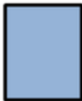
Full Page Bleed ( Interior) 8.5" x 11" $950.00